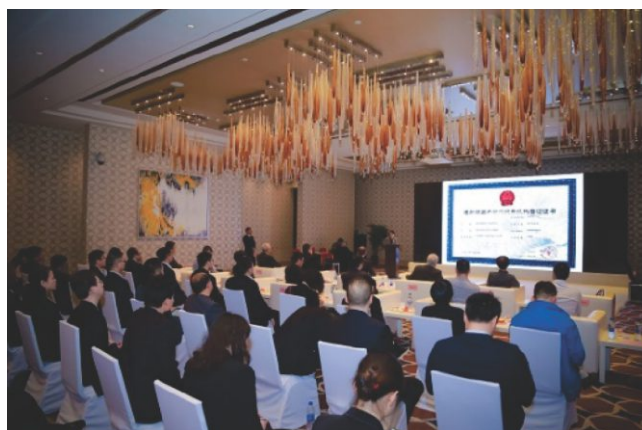
AHRI’s office in Hefei opened on April 13.