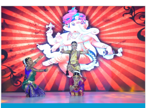
Ganesh Vandana as the event opens