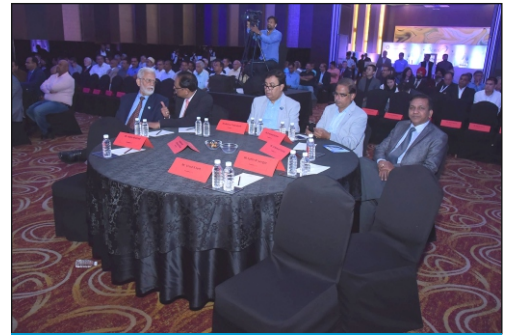
Dignitaries at the Curtain Raiser event